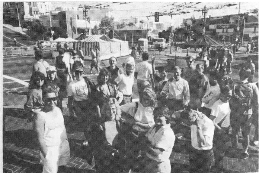
HTG'ers after the Stairway Hike in San Francisco.

Add $2 for shipping Maake check payable to HTG and mail to our PO Box.